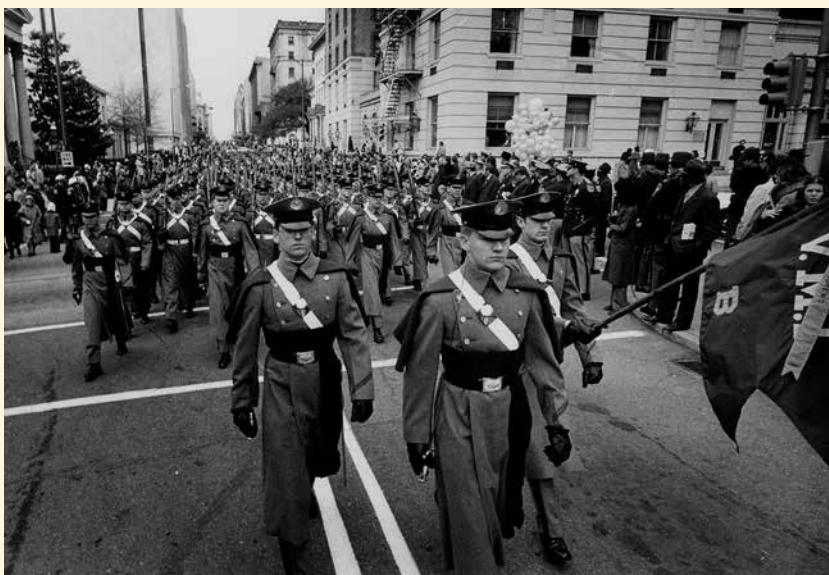
One-third of the Corps of Cadets march in the inaugural parade of Gov. Mills E. Godwin Jr.