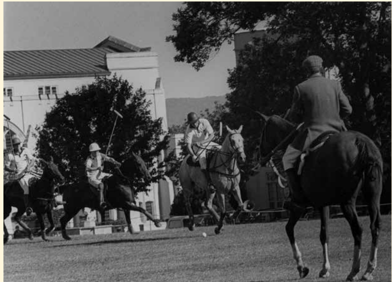
The Parade Ground temporarily serves as a polo ground in 1976, when the British Army Polo Club visited VMI.

Twenty cadets from the rugby club traveled to England where they played three matches during spring furlough. They were guests of the Royal Military College of Science (RMCS) at Shrivenham. The matches were played against the Royal Military College at Sandhurst, with