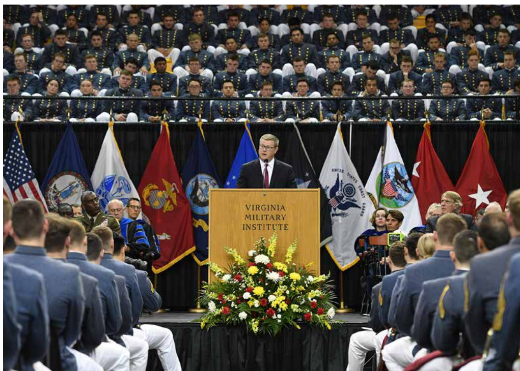
Ryan McCarthy '96 speaks to graduating cadets during commencement in Cameron Hall.