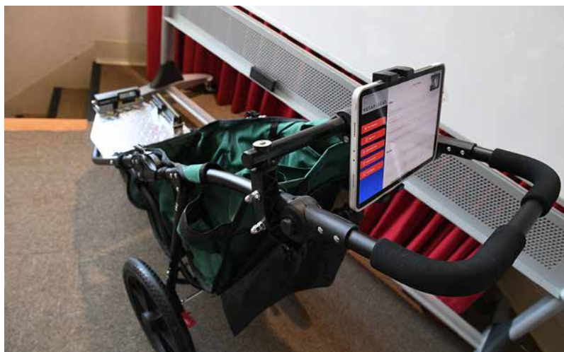
The HETAP system modified by cadets stands ready for use on hiking trails.

their mobile device with augmented reality capabilities to a wheeled cart, stroller, or wheelchair, walk a trail and create a real-time map. Pins can be dropped to mark certain points on the trail, and the camera on the mobile device can be used to take measurements of the trail width at key points. All the data collected is then processed and made available so potential trail users can gauge the difficulty of traversing the trail," said Moran. The team admitted