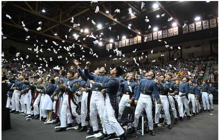
Members of the Class of 2024 toss their gloves in the air at the conclusion of commencement.